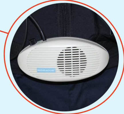
Loudspeaker Amplifier for Communication Locally through CBRN Suit