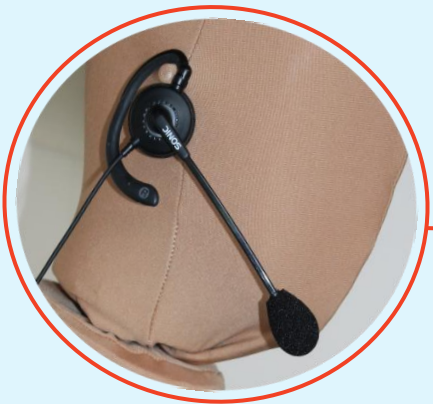
Light Weight Headset shown alternatives such as Acoustic Tube are available