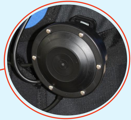
80mm PTT button for Radio allowing easy operation through CBRN suit