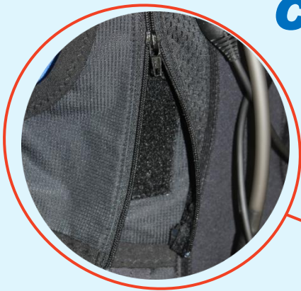
Zipped holder for cable / hydration tube management