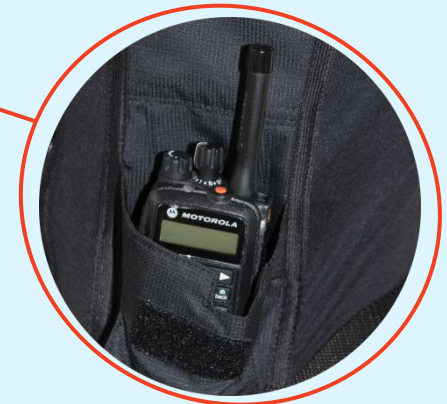
Left Hand Pocket (shown with Motorola Radio)