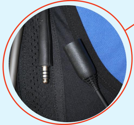
Earpiece terminated with NEXUS Connector allows for quick disconnection