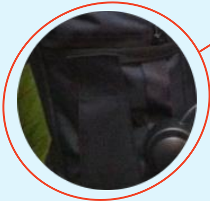
Right Hand Pocket