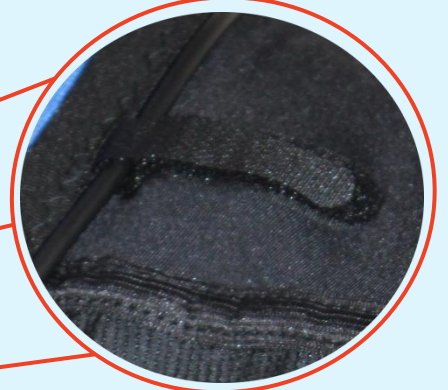
Hook and Loop Fastenings for cable management