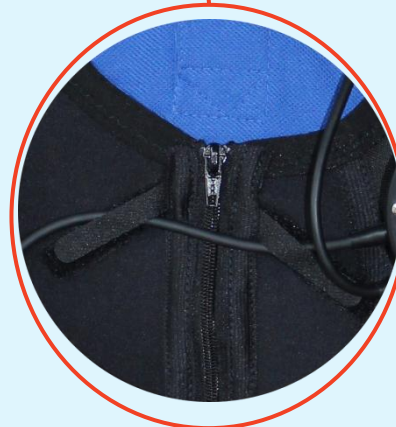
Front Full Length Zip allowing user to put-on/take-off easily