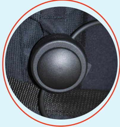
50mm PTT button for Amplifier allowing easy operation through CBRN suit